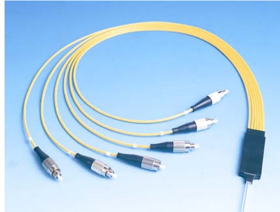
R 6F-FC /UPC / SM / \Phi 2- 3 /06 M